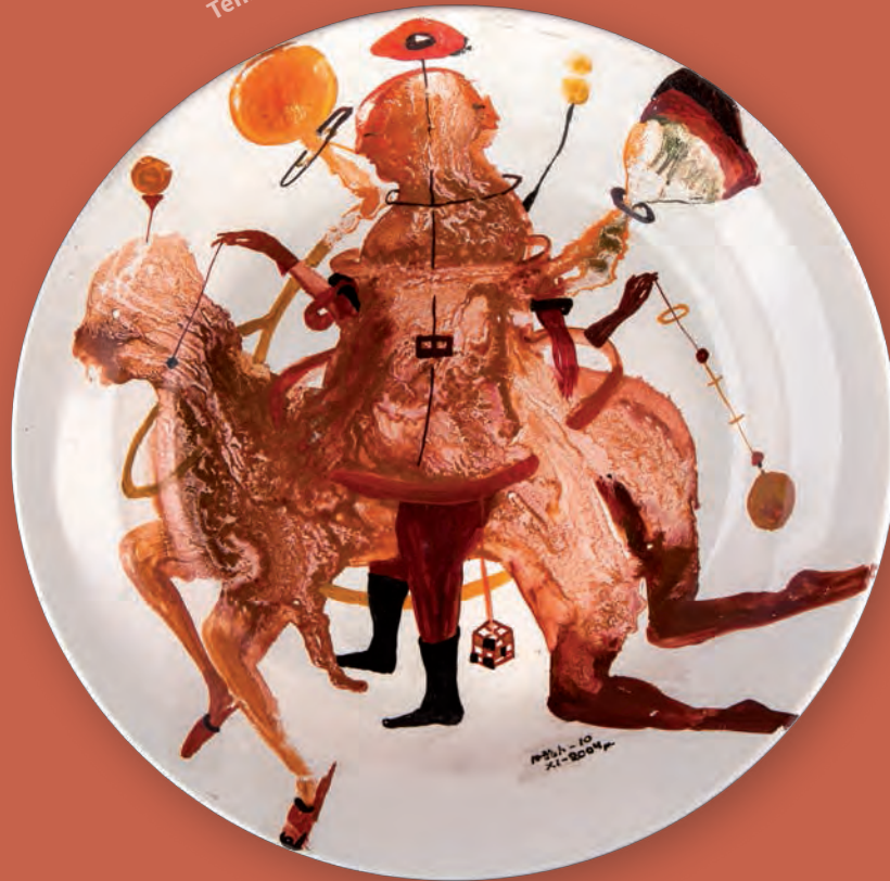
Teni Vardanyan, Untitled, 2004