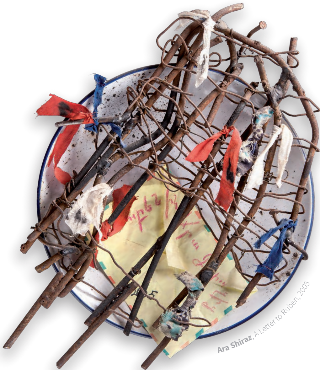
Ara Shiraz, A Letter to Ruben, 2005