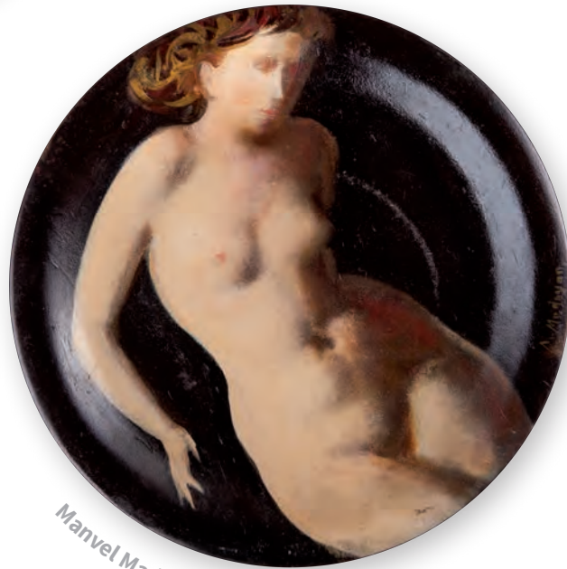
Manvel Madoyan, Women Series, 2008