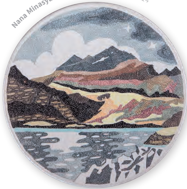
Nana Minasyan, Lake on Mount Aragats, 2014